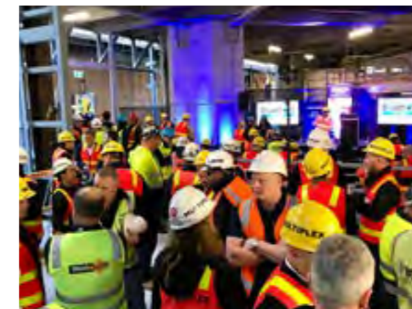
ABOVE: Attending the launch of Incolink's Bluehats Suicide Prevention Program

This year, we participated in activities that focussed on and supported the health and wellbeing of our staff and the members that our Association represents.